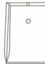
Lap Seal Bag With Valve Bag