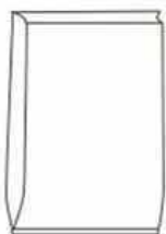
4 Sided Sealed Bag