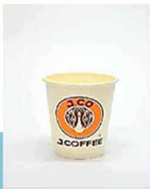
UNH 12 OZ