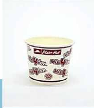
UCI 8 OZ