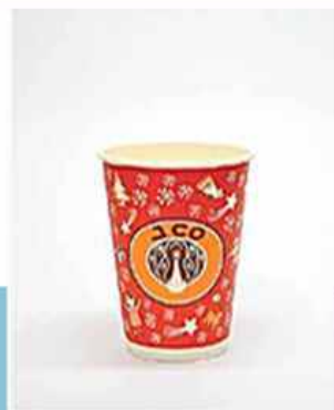
UHT 16 OZ