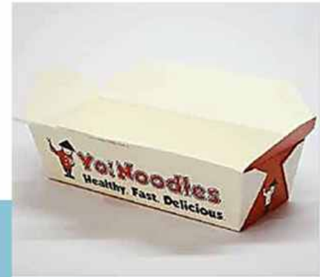
CUSTOMISED FOOD PAIL