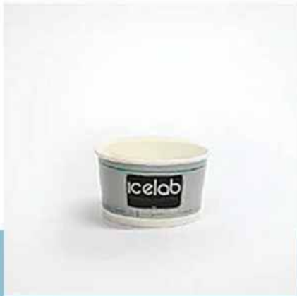
UNI 12 OZ