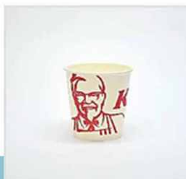
UCS 12 OZ