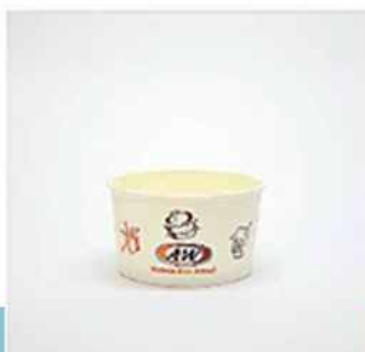
UNS 12 OZ