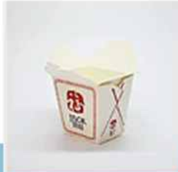
UFP 12 OZ