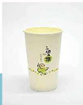
UCH 20 OZ