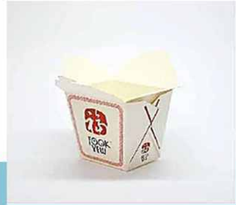
UFP 12 OZ