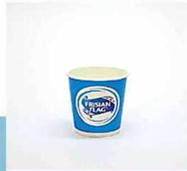
UCH 6,5 OZ