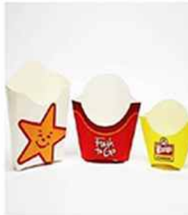
French Fries Pouch