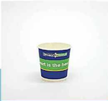
UCH 06 OZ