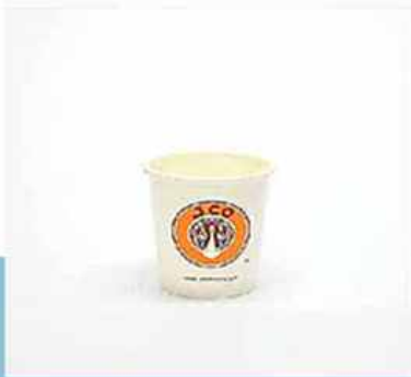
UCH 04 OZ

Single wall hot cups are polyethylene coated on the inside of the cup only. They are suitable for all hot beverages.