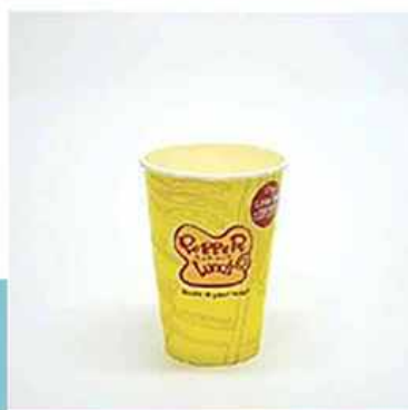
UNT 16 OZ