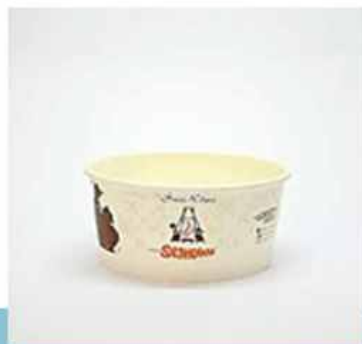
UNS 24 OZ