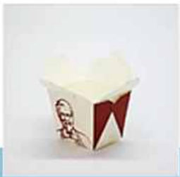
UFP 10 OZ