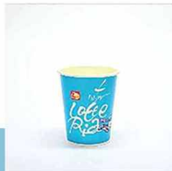
UCD 8 OZ