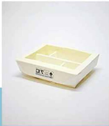
ULB PARTITION WINDOW