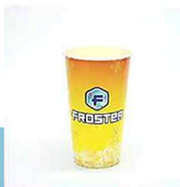
UCD 20 OZ