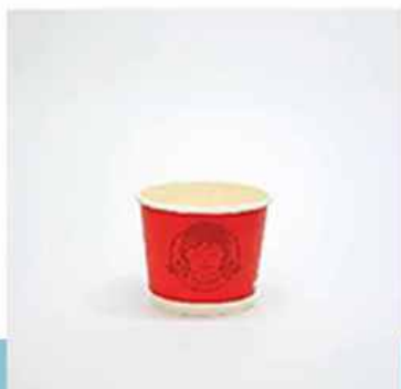
UCS 08 OZ

Bowls are double coated with polyethylene (not laminated) for liquid based and greasy food. We provide a range of standard sizes as well as custom printed items. Our material is leak-proof and microwave safe.