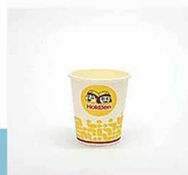
UCH 09 OZ