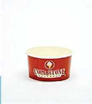
UCI 5 OZ