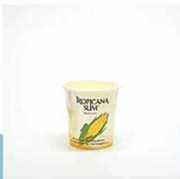
UCD 6.5 OZ