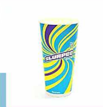
UCD 22 OZ