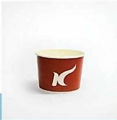
UNI 17 OZ