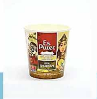
UCD 12 OZ