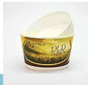
UNS 33 OZ INNER TRAY AVAILABLE