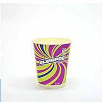
UND 12 OZ