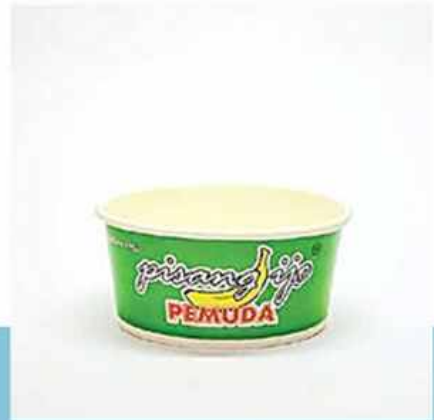
UNI 24 OZ