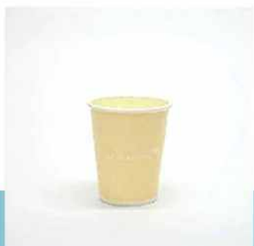
UCD 9 OZ