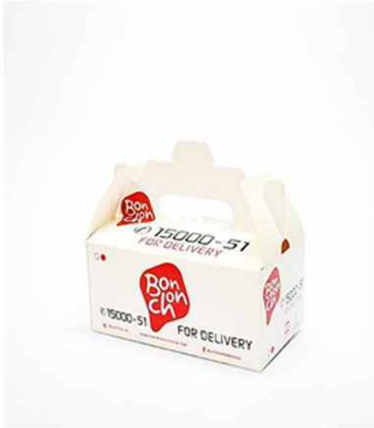
Customized Take Away Box

LET US HELP YOU DEVELOP YOUR VERY OWN PACKAGING