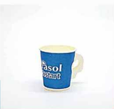
UCH 09 OZ