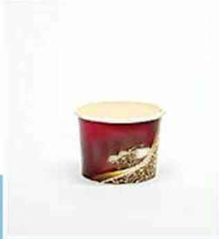
UCI 4 OZ

Ice cream tubs are made from heavy weight paper double coated with polyethylene, which provides a very good barrier for cold foods and liquids. They are ideal for holding ice cream, frozen desserts, yoghurts, and slush type drinks.