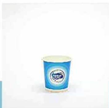
UCD 4 OZ

Single wall cold cups are polyethylene coated on the inside of the cup only. They are suitable for all cold beverages.