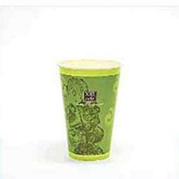
UCD 12 OZ