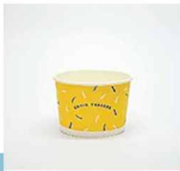
UNS 17 OZ