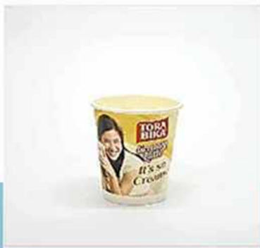
UNH 08 OZ